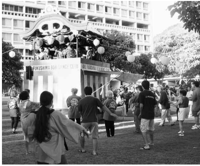
An EWC sponsored Bon Dance exposes international students to this Japanese tradition.

Bon Dance , led by the Honolulu Fukushima Bon Dance Club, introduced this traditional folk dance to more than 200 international participants. This event was presented in connection with the Japanese Temple Architecture of Hawai'i EWC exhibition.