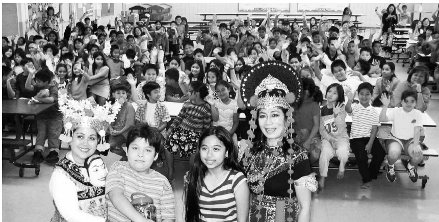
Kaiulani Elementary School students enjoyed an EWC Indonesian mask-dance performance in appreciation for their "Million Pennies" tsunami fundraiser.