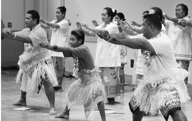
Wallis and Futuna Islands Ensemble performing at Punahou School as part of an EWC residency in July 2005.