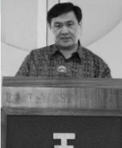
His Excellency Enkhbayar Nambar, president of Mongolia, speaking at the East-West Center.

East-West Wire: emailed to approximately 2,000 journalists and other professionals worldwide featuring timely, topical reports covering EWC news, commentary, analysis, and publications on important regional issues