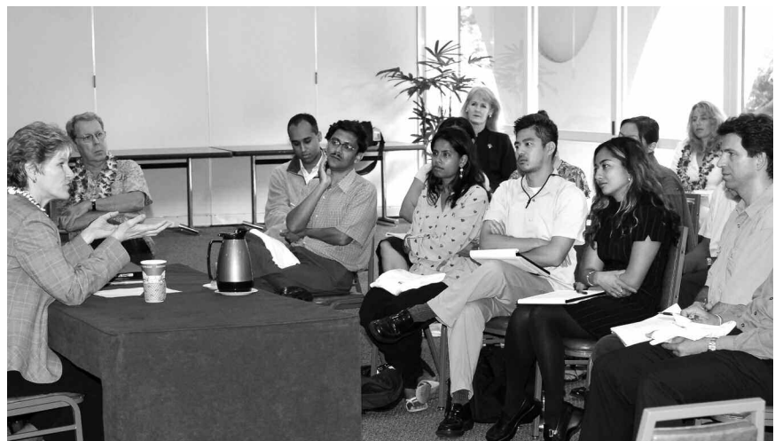
Karen Hughes, U.S. undersecretary of state for public diplomacy and public affairs (left), engaging EWC students in discussion.

EWC Observer: quarterly publication featuring EWC news and events, recent publications, and EWC Foundation activities